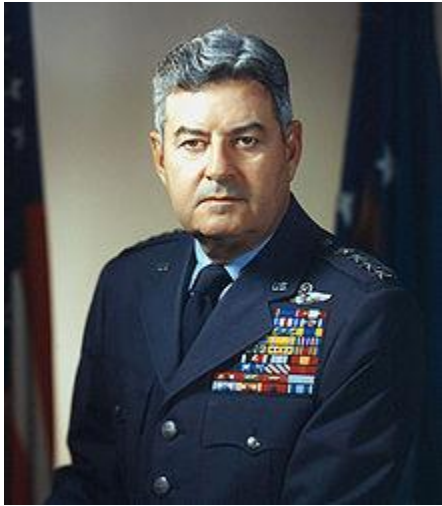
General Curtis Lemay

General Curtis Lemay once said to stop swatting flies and go after the manure pile. When gun manufacturers defend themselves successfully against junk lawsuits, or primarily Republican members of Congress joined by a handful of centrist Democrats, fend off yet another feel-good-do-nothing gun law, they are swatting flies. When I and other Second Amendment activists broke the back of the Million Mom March in 2000 by exposing its use of 501(c)(3) tax exempt resources to influence the election, we not only got rid of one of the manure piles but we may have even cost Al Gore the election. We must now finish the job by discrediting the anti-Second Amendment movement to the point where no political figure (outside places like Los Angeles, San Francisco, and New York City) who values his or her career will support it. We must make infringement on the rights of law-abiding citizens just as socially unacceptable as Jim Crow and segregation. Then we will not have to worry about more junk lawsuits or junk legislation.